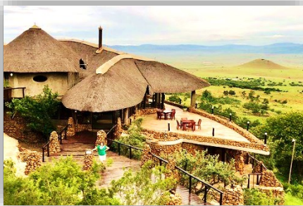
Stunning Isandlwana Lodge in KwaZulu-Natal