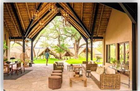
Unforgettable Thornybush Safari Lodge