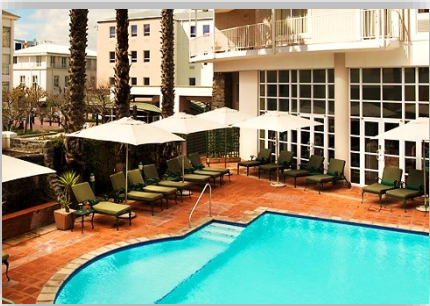
Boutique Commodore Hotel Cape Town