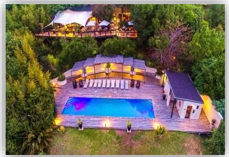
Hog Hollow Lodge - Plettenberg Bay